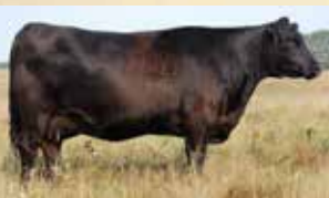
Maternal Great Granddam